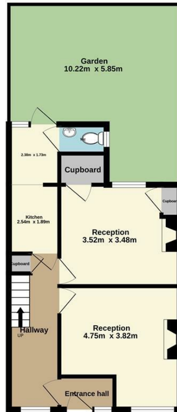
Ground floor 57.7 sq.m. approx.